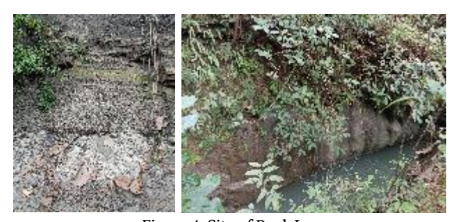
Figure 4. Site of Rock Layers

processes. The soil/rock layer is a site for knowing the age or history of the area used as a research point for scientists and researchers.