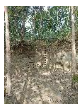
Figure 5. The Excavation Site

The excavation site where artifacts, skulls, and bones of several ancient humans were found, such as homosapiens, homoerectus, and others, has become a tourist attraction. This excavation site is a medium of education for tourists and visiting researchers.