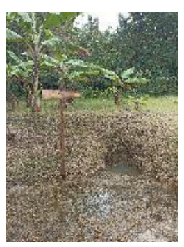
Figure 6. Salt Spring

In addition, there is also the presence of a salt spring in the middle of a community plantation, which is unique to Krikilan Village. The salt spring water discharge sources will decrease in the dry season and increase in the rainy season. This salt spring is quite interesting to understand the historical phenomenon of the Sangiran area, but there is no complete and adequate information about this spring.