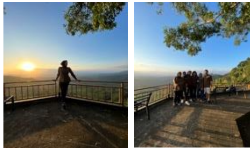
Figure 1. Manggul Joyo

beautiful sunset. Visitors will be treated to beautiful skies and expanse views of rice fields and plantations from the height of Manggul Joyo. In the Manggul Joyo area, there are facilities providing food and drinks, there visitors can enjoy the beautiful scenery while enjoying a cup of hot coffee and various snacks. Manggul Joyo is very suitable as a tourist attraction for visitors who like taking selfies because several photos naturally exist, and photo spots are deliberately provided. The location of Manggul Joyo is very strategic because it is only about 25 minutes from the center of Purworejo Regency, but access to Manggul Joyo from the entrance gate is quite steep. So visitors who bring private vehicles are strongly advised to be more careful when heading to the Manggul Joyo area. Apart from that, several things need to be developed and improved, including the number of street lighting lamps, road dividers, signage, footpaths, and seating areas for tourists to enjoy the beautiful views of Manggul Joyo.