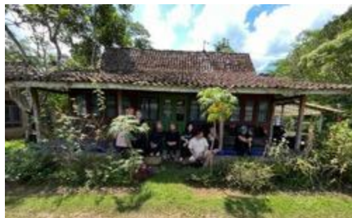
Figure 4. Traditional House