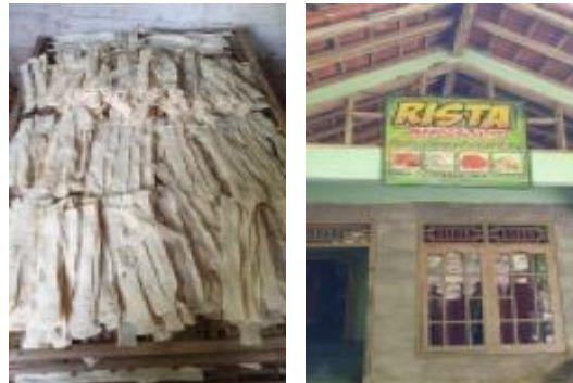
Figure 9. Slondok Mr. Samsul Anwar

lanting snacks. The marketing process for the products varies; some are taken directly by collectors, sold in markets or shops, or bought directly by buyers at their homes. Because the slondok production process is carried out at home, tourists can directly see the manufacturing process, starting from the form of whole cassava to becoming slondok that is ready to be sold on the market.